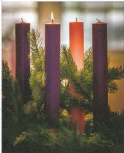
ONE PHOTO / USA: JOHNSTON, ST. LOUIS REVIEW

Go to DearPadre.org to send your question and to learn more about Dear Padre .